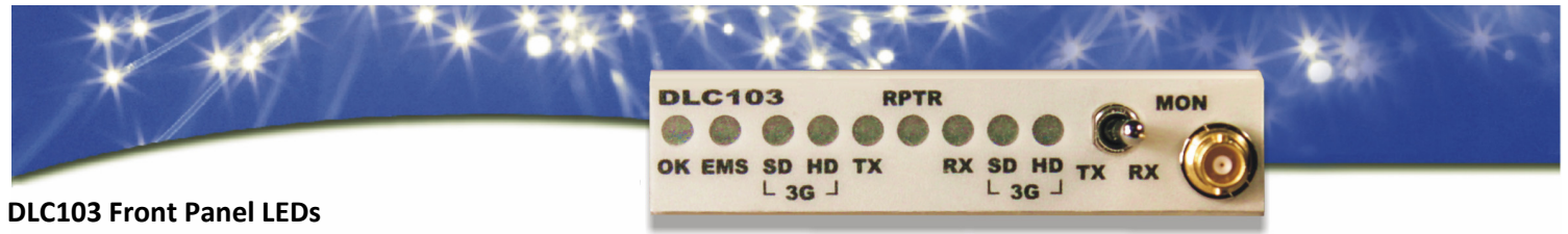
DLC103 Front Panel LEDs