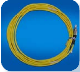
Single Mode Optical Panel Patch Cords