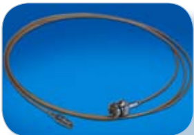
Mini 75-ohm SMB to BNC