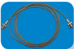
BNC to BNC Cable, 72" L