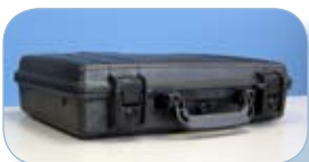
DL4100 Travel Case