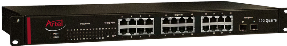
Quarra 10G PTP Ethernet Switch