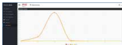
Alarm History View