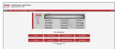
Launch DL/IL Manager for more diagnostics