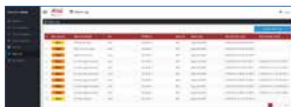
Alarm Log View

Many deployments subscribe to a “tiered” approach where regions and sub-regions collaborate with a national operating center requiring several instances of xView servers providing access to Artel systems via a management network.